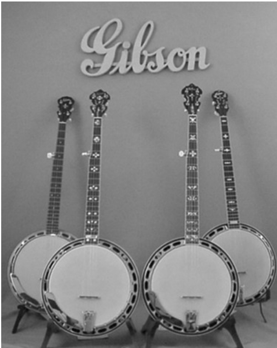
Gibson Banjos — Gibson Banjo models (left to right) RB, Earl Scruggs, RB-75 J.D. Crowe, and RB-250